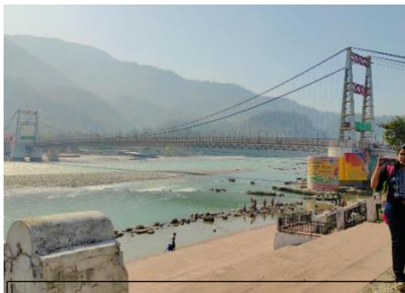
Triveni Ghat, Rishikesh