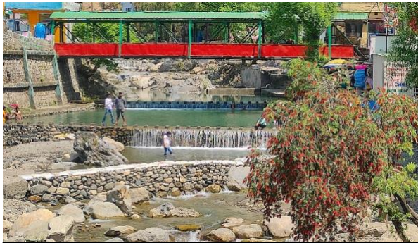
Sulphur Spring at Sahastradhara