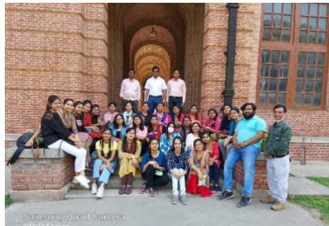
Samsung Quad Camera © Pooja Sarkar