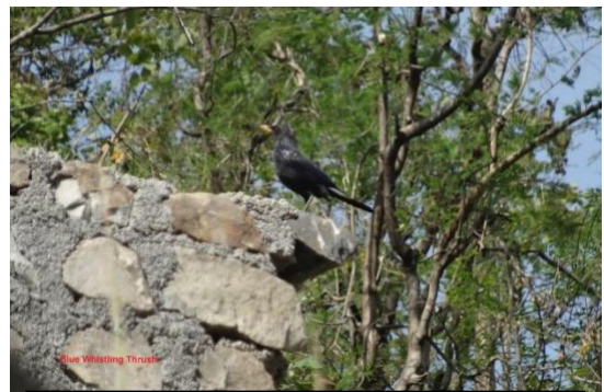
Blue Whistling Thrush