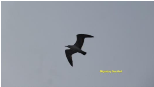
Migratory Sea Gull