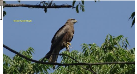
Green Spined Eagle