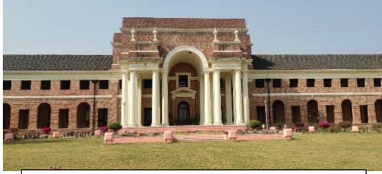
Forest Research Institute Dehradun