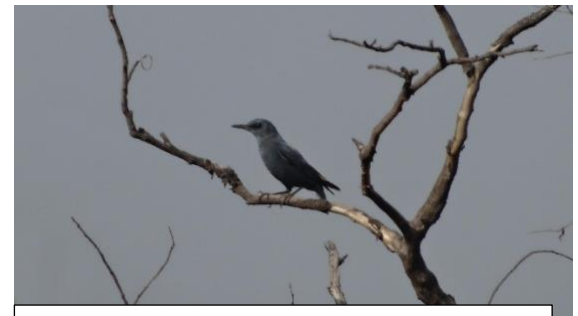
Blue Rock Thrush