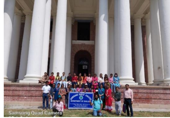
Samsung Quad Camera