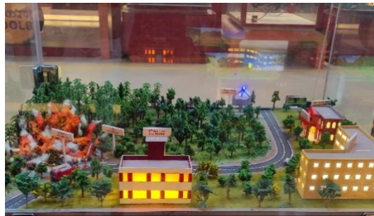
Timber Museums at Forest Research